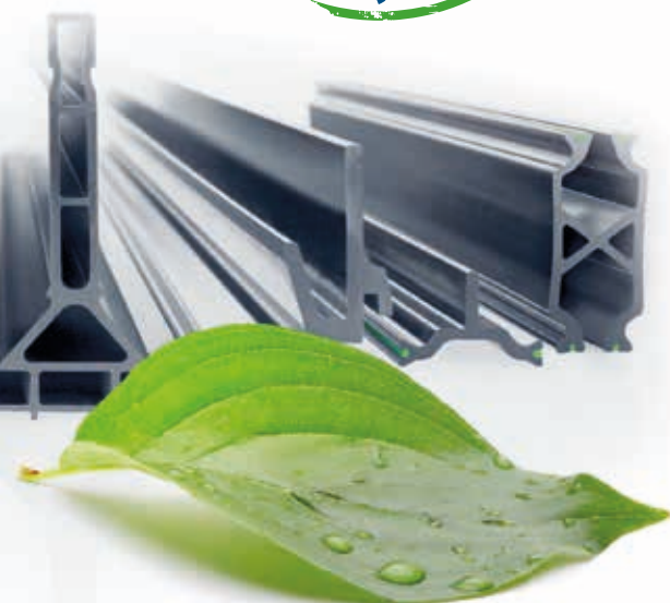
Consumption of fossil fuels

Less consumption and lower environmental burden – more points with “green” construction!